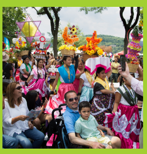
La Guelaguetza Dutchess Partners in the Arts